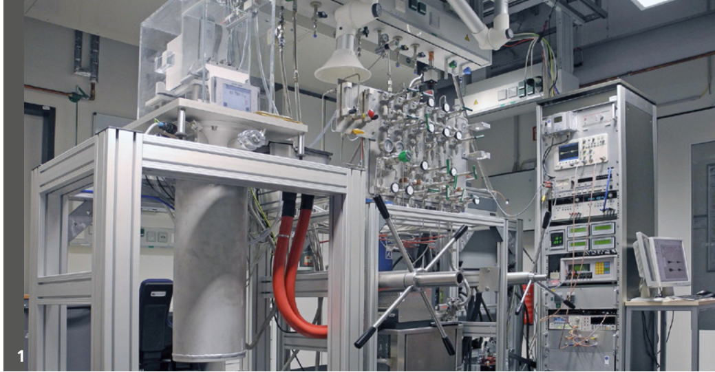
1 Single-Sinker Densimeter for density measurements in the temperature range from 253 to 453 K with pressures up to 20 MPa, consisting of the core apparatus with measuring cell, magnetic-suspension coupling and analytical balance (left), manifold and thermostate (centre) and 19"-rack with electrical devices (right), such as resistance measuring bridge or measuring computer.